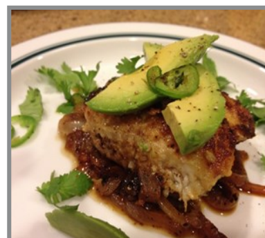
Greens on blues, a Latin-inspired Dish with Chesapeake Bay Blue Catfish