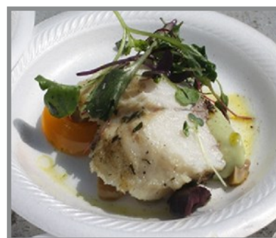
Delicious Chesapeake Bay Blue Catfish

Blue Catfish on campus and includes it in menus and promotions. An estimated 7,265 pounds of blue catfish were served on campus during the fall 2019 semester.