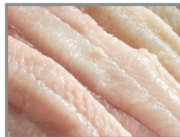
Chesapeake Bay Blue Catfish Fillets